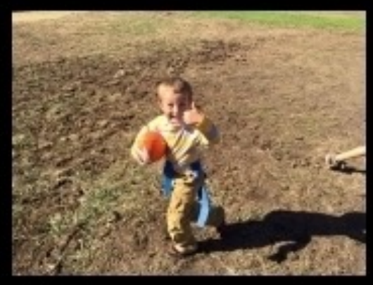
What parents know I do.