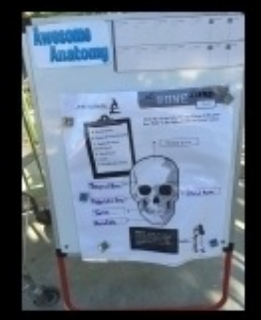
What admin knows I do.