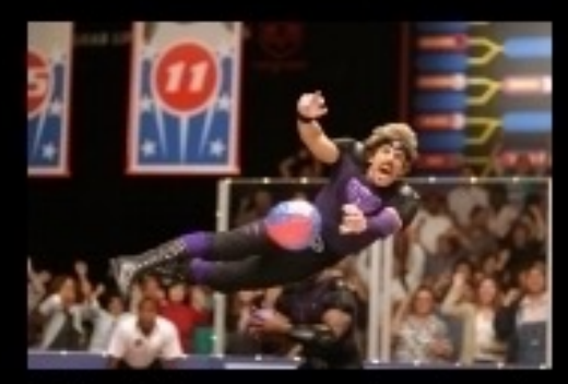
What I'll never actually do.