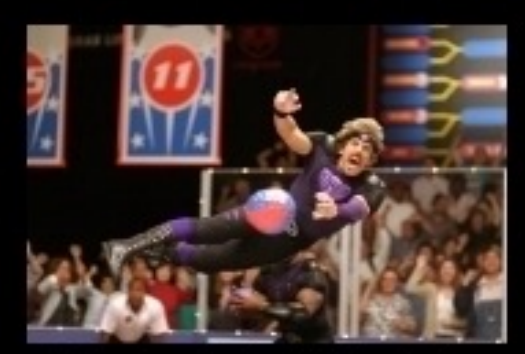
What admin thinks I do.