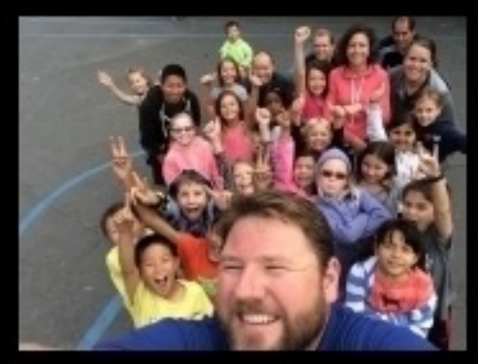
What my mom knows I do.