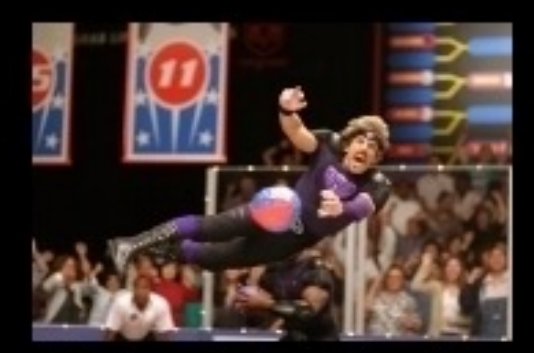
What society thinks I do.