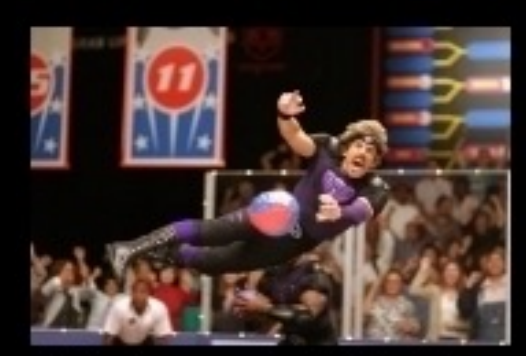
What parents think I do.