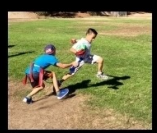
What my friends know I do.