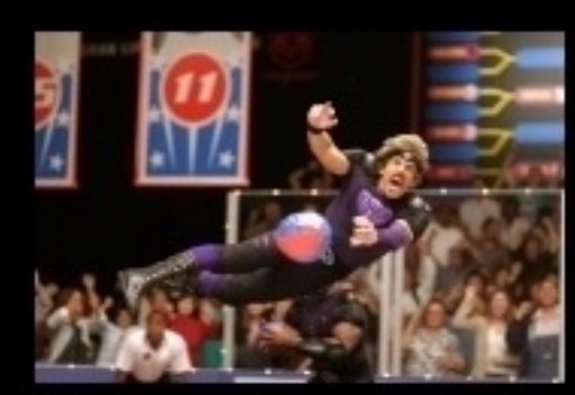
What my mom thinks I do.