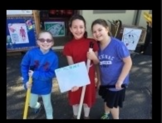
What society knows I do.