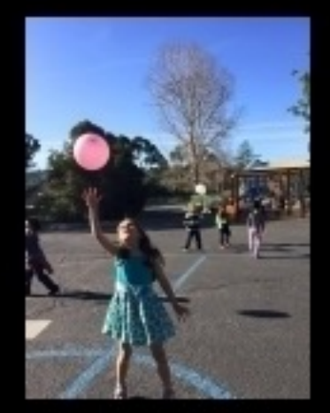
What I always do.